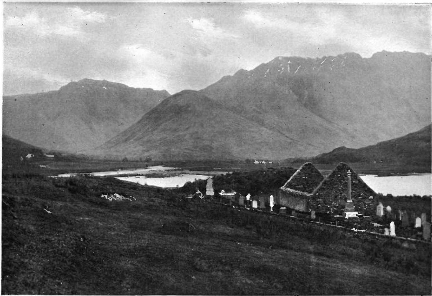
CLACHAN DUICH OLD CHURCH AND BURIAL GROUND OF THE CLAN