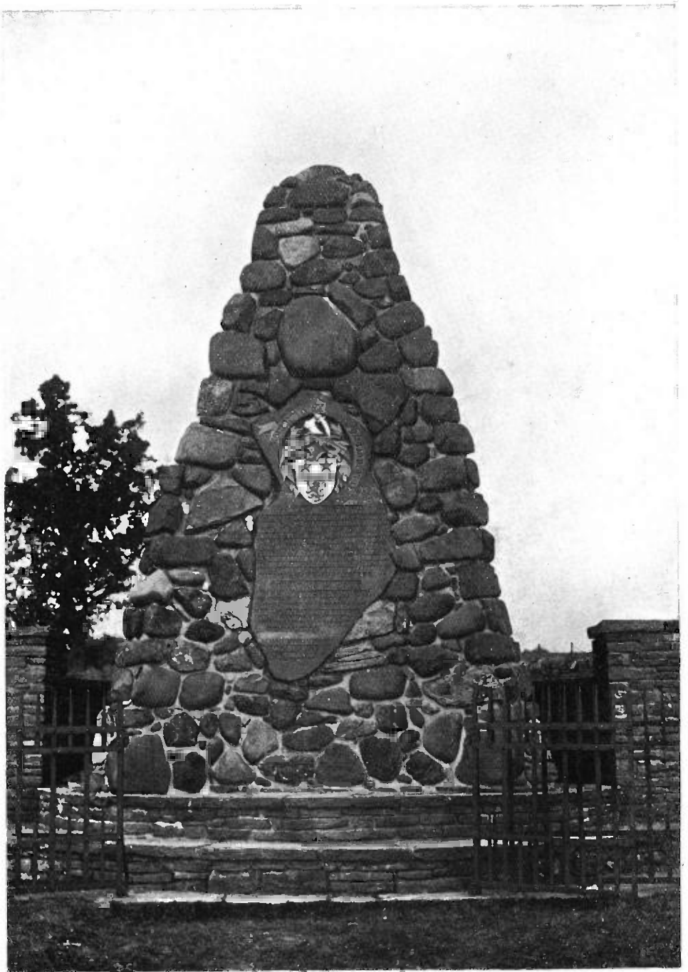
CAIRN ON SHERIFFMUIR