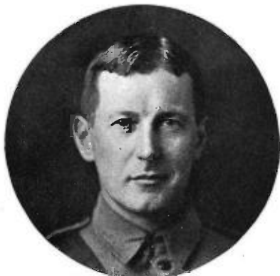
John McCrae, Lt.-Col. Canadian Army Medical Corps.