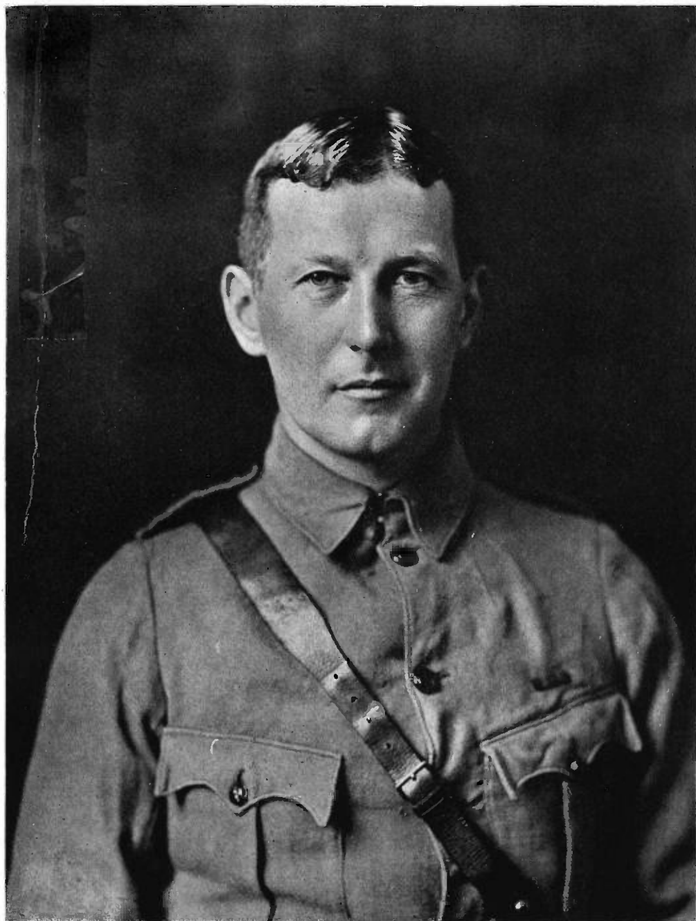
LIEUT.-COLONEL JOHN McCRAE Canadian Army Medical Corps.