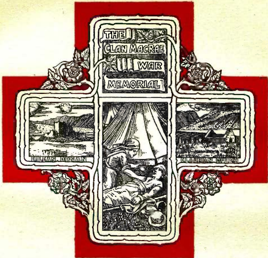
Reproduction of the illustration on the appeal for the Memorial.