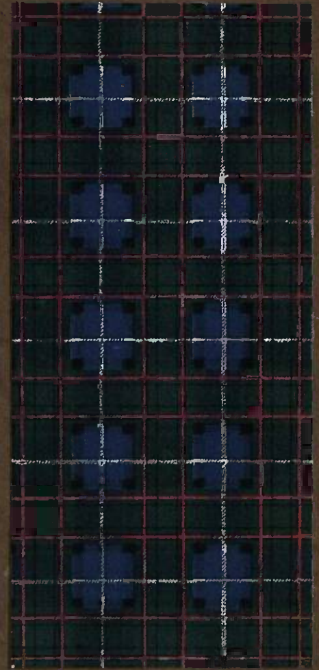
MACRAE HUNTING TARTAN