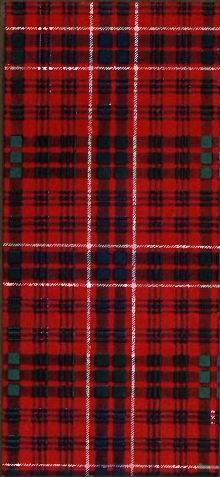
MACRAE DRESS TARTAN