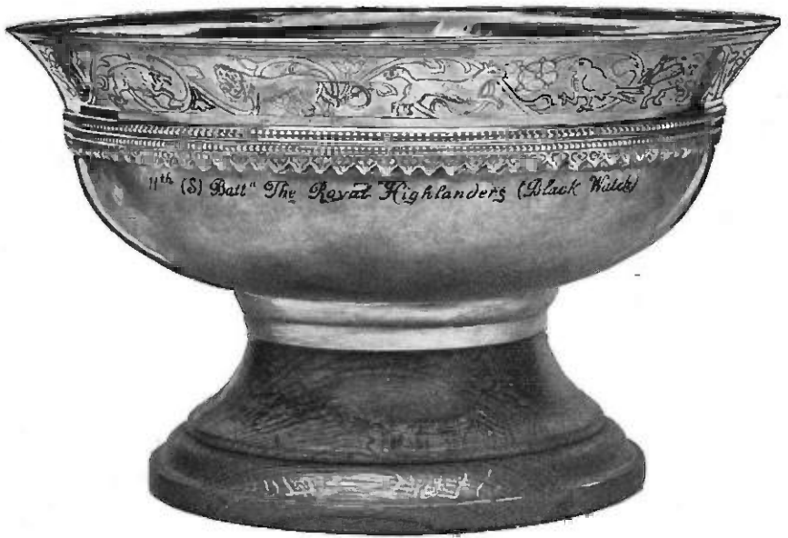
11TH ROYAL HIGHLANDERS' SOUVENIR BOWL